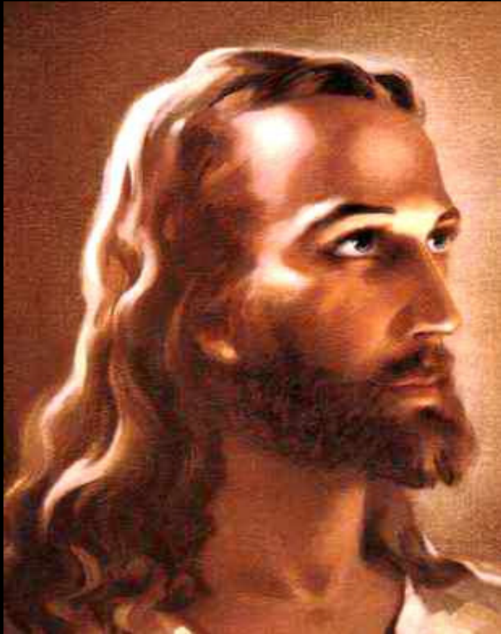
Warren Sallaman's Head of Christ