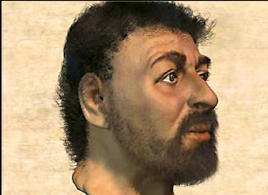
Illustration for Popular Mechanics/BBC